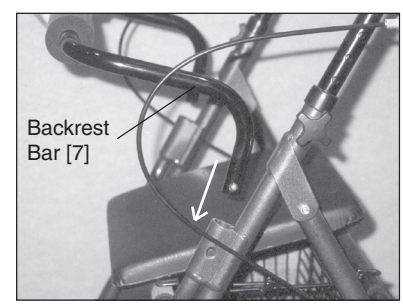
Fig. A, Attaching the Backrest Bar